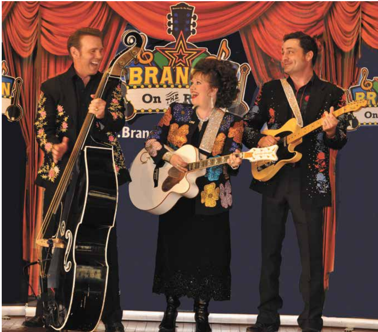
National touring show "Branson on the Road" is coming to the Alabama Gulf Coast Music Hall Jan. 4 with two big shows: 2:30 p.m. and 7 p.m. The show includes a variety of genres from Americana, Bluegrass, Rockabilly, Classic Country, Comedy & Rhinestones. Tickets are $20 advance or $25 at the door. Details: 251-978-2462 or alabamagulfcoastmusic hall.com .